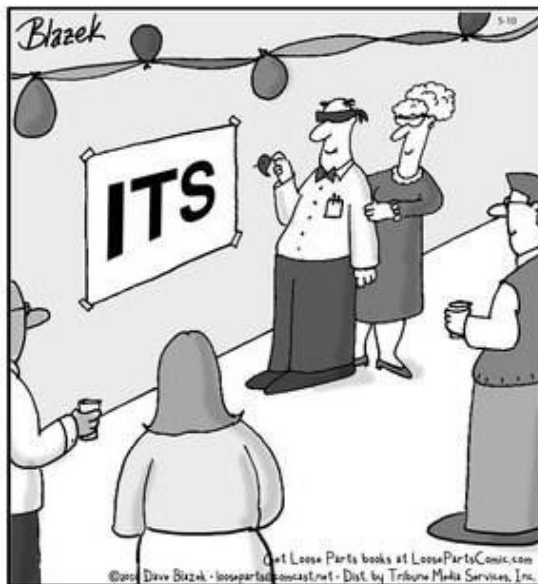
Things get crazy at a court reporter's party